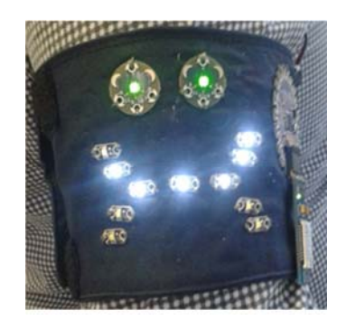
Figure 3: The Emotion-Bracelet is representing a happy emotional state

Figure 3 shows an example of the performance of the Emotion-Bracelet where a user posts the following comment: "you are one of the more beautiful pages that have been written in mi life <3 (in Spanish: tu eres una de las páginas más lindas que ha sido escrita en mi vida <3)" on Facebook, the web service classifies the comment as happy, and the Emotion-Bracelet displays the emotion \Im .